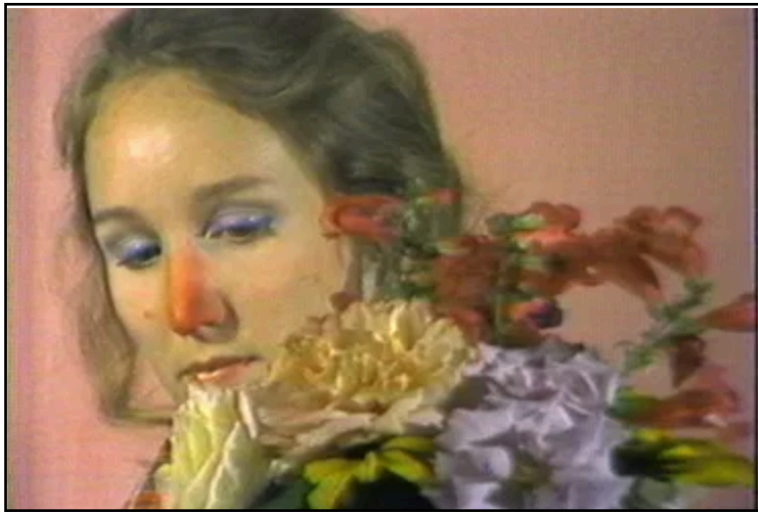
Fig. 1: Images are not critical, we must remember that.