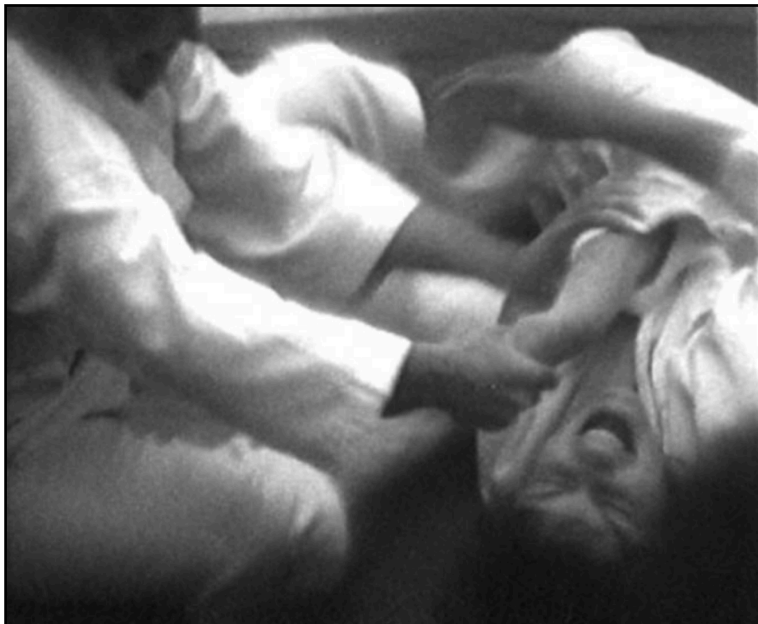
Fig. 3: 60,000 times faster than text, a quitter's way out.