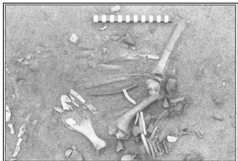
Fig. 6: We're changing and evolving for different reasons, you and I differ in our motor skills and hemispheres. Slightly, but not to any great length.