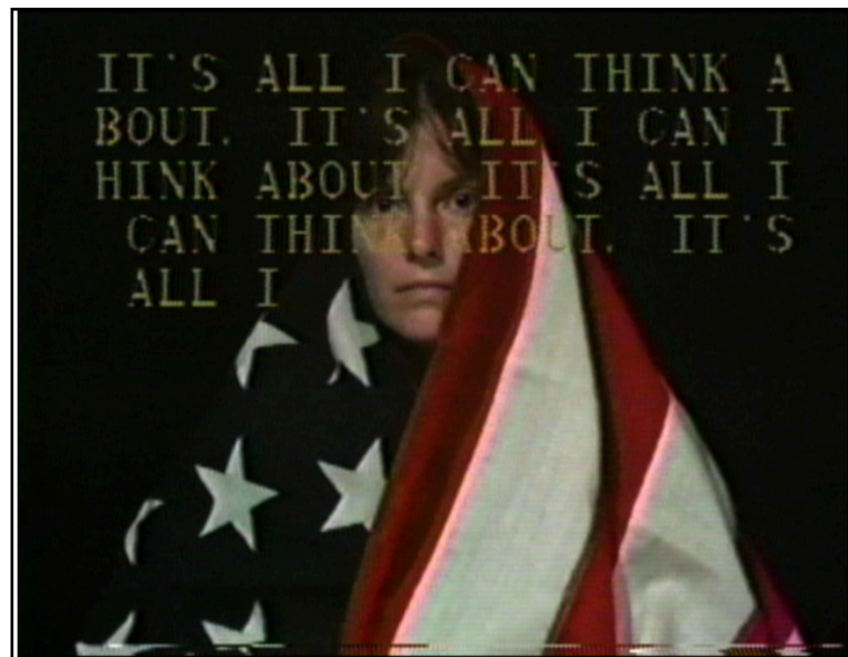
Fig. 4: Both activate the premotor, inferior frontal, posterior inferior temporal and parietal areas.