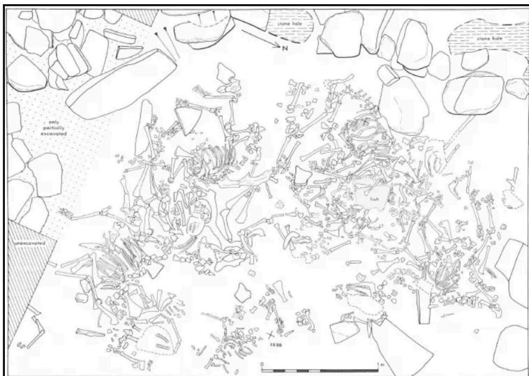
Fig. 5 Images however have a greater activation in the Brodmann area 46 and BA 37, who would have thought.